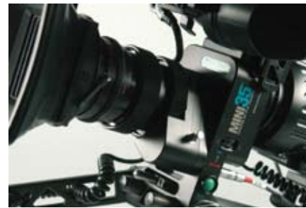
MINI35 with IMS PL-Mount and Cooke 35mm cine lens

The P+S Technik Interchangeable Mount System consists of an intermediate positive lock mount on camera side and various lens mount adapters (picture below). P+S Technik also offers the intermediate mount on camera side as an open standard. It is available for purchase for integration in your camera projects. Please contact us for more details by email to info@pstechnik.de